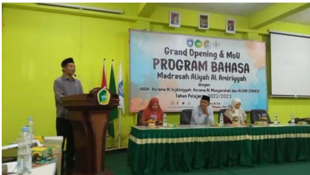
Figure.1 Gren Opening & MoU for the Aliyah Al Amiriyyah language program

The picture above is an MoU activity carried out by KH. Mukhtar Syafa'at University with Madrasah Al Almiriyyah. Followed by students of class X, accompanied by tutors from UIMSYA students. With the implementation of the English Weekend program which has been agreed upon by Aliyah Al Amiriyyah (MAA) school and KH. Mukhtar Syaf'aat campus, the