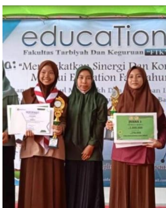
Figure 4 documentation of winning students in the Breaking News competition

The picture above is proof of the 1st place winner of the Breaking News competition followed by Ashtrid Q, one of the MAA students, a competition held by Education at the East